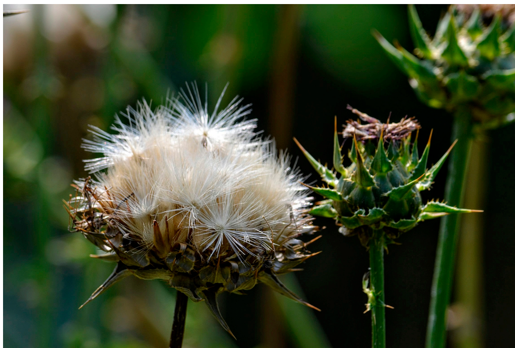
Figure 1. Milk thistle ( Silybum marianum L. Gaernt.).

In Silybum marianum fruits have been used by mothers for stimulating milk production. S. marianum is also associated with a legend that the white veins of the plant's leaves were caused by a drop of the milk of the mother of Jesus. When leaving Egypt with the infant Jesus, she finds a shelter in a bower formed from the thorny leaves of the milk thistle. Thanks to this legend, milk thistle is sometimes called Mary thistle, St. Mary's thistle, holy thistle, blessed virgin thistle or Christ's crown [2].