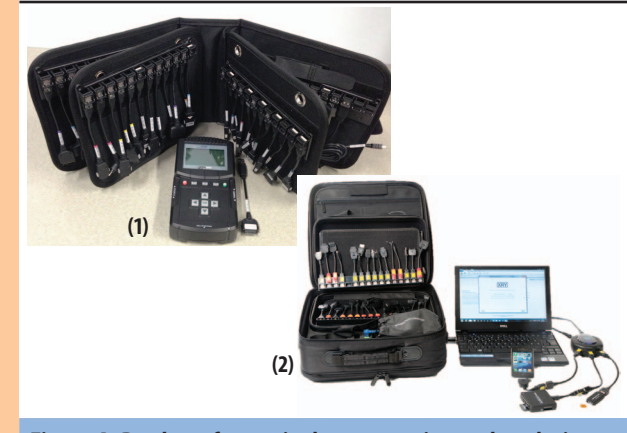
Figure A. Products for use in data extraction and analysis: (1) Cellebrite UFED and (2) Micro Systemation XRY Complete/ XACT.

Because of the incredible amount of personal and business information stored on mobile devices—or that can be inferred from information on them—security and privacy challenges abound. In addition to placing user information on the phone, the OS also stores information unbeknownst to the user. For example, in April 2011, Apple received considerable media attention when it became known that the iPhone had been recording a detailed history of user geographical locations in an unprotected file; with a simple extraction, a forensic examiner could create a geotagged map of all of the places that iPhone (and presumably its user) visited. The key lesson: sensitive data should always be encrypted in smartphones.