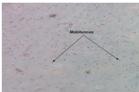
FIGURE 3: Direct Gram stain of high vaginal swab showing Gram negative curved rods- Mobiluncus .