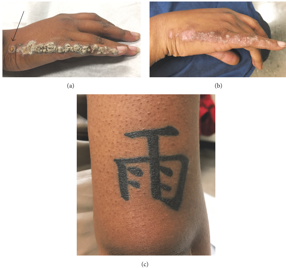
FIGURE 3: (a) Close-up of lesions present on right fifth finger and dorsum of hand. At two-week follow-up, new papules appear in the area that is previously electrodesiccated (black arrow). (b) Remarkable clearing of the lesions and postinflammatory hypopigmentary changes can be seen after 8 doses of ixekizumab. (c) Psoriatic lesions are no longer present on the tattoo after treatment with 8 doses of ixekizumab.

parakeratosis [5]. Under these circumstances, immunohistochemical studies are helpful in distinguishing these two cutaneous disorders. For example, involucrin is a marker whose expression is absent in the parakeratotic areas of ILVEN but present in psoriasis [6]. Moreover, the number of Ki-67 positive nuclei is higher in psoriasis compared to ILVEN, while the number of keratin-10 positive cells is higher in ILVEN [7]. In practice, these tests are rarely ordered. It is often more practical to simply initiate therapy for psoriasis if the diagnosis is suspected.