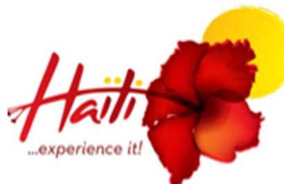
Fig. 1. New logo Haitian DMO.

The study is a prolongation of a study by Muller, Kocher, and Crettaz (2013, p.86), in the sense that their study advocates the change of logo as being positive for a brand as “the introduction of a new logo leads consumers to perceive a brand as modern.” However, their study does not consider specific elements constituting logos (e.g. shape and color). Color is an important focus of this study because, alongside corporate name and type-face, design is also one of the main factors that