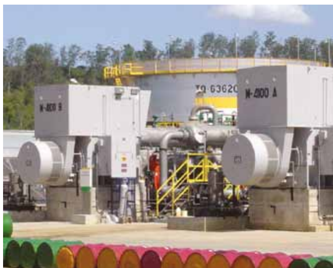
Synchronous motors SEF900 (Ex-p), 3600 kW, 13,200 V Application: Reciprocating compressors (petrochemicals)