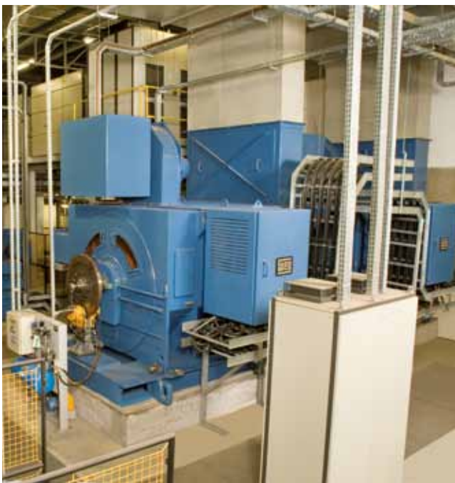
Laboratory of test