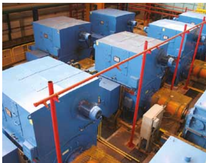
Synchronous motors SDL800, 3000 kW, 3100 V Application: Rolling mills (iron and steel)