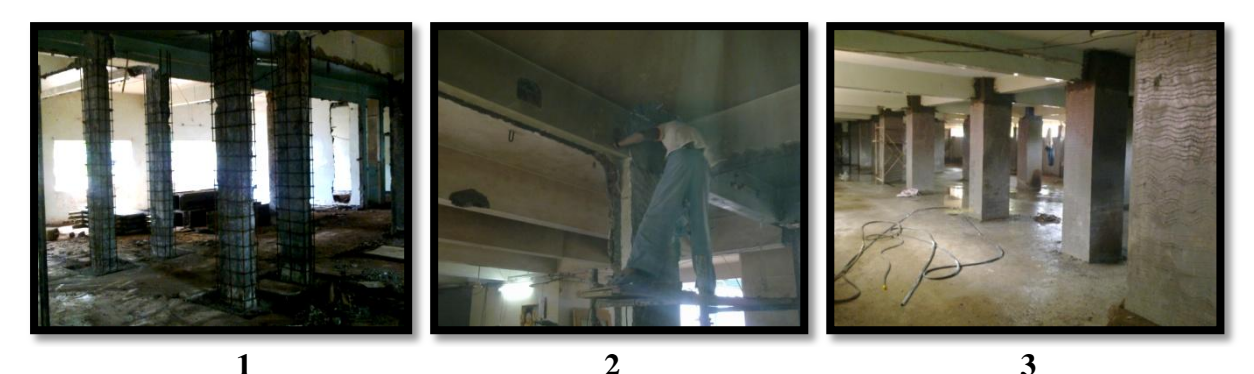
Fig. 2 Photographs shows the step by step stages of retrofitting work for the considered Health Building at Nashik

The estimated cost of retrofitting the existing structure is 4.5 crore. To meet the further requirement of infrastructure the management now is constructing additional new building with G + 2 storey, instead of razing the existing building.