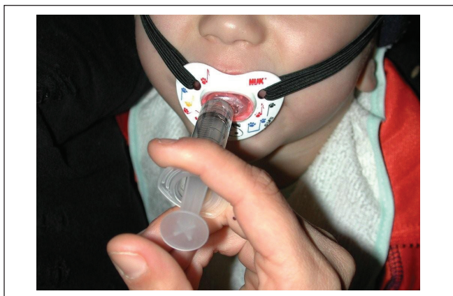
Figure 4. The appliance allows food intake

In order to prevent self-biting, and in cooperation with the Department of Pediatric Dentistry and Orthodontics at the University Rey Juan Carlos (Madrid, Spain), a device was designed using the external frame of a pacifier and fixing a transparent silicone splint (Odontoseal, Drève) to it with resin to cover both the upper and lower arch (Fig. 3). An anterior opening was made in the silicone splint to allow the ingestion of liquids and crushed food during treatment without having to remove the appliance (Fig. 4). In order to maintain the device in place, it was necessary to fix the device to the occipital region by adding two elastic bands sewn into a hat (Fig. 5). Once the family had been trained in using the device, the patient was discharged from hospital.