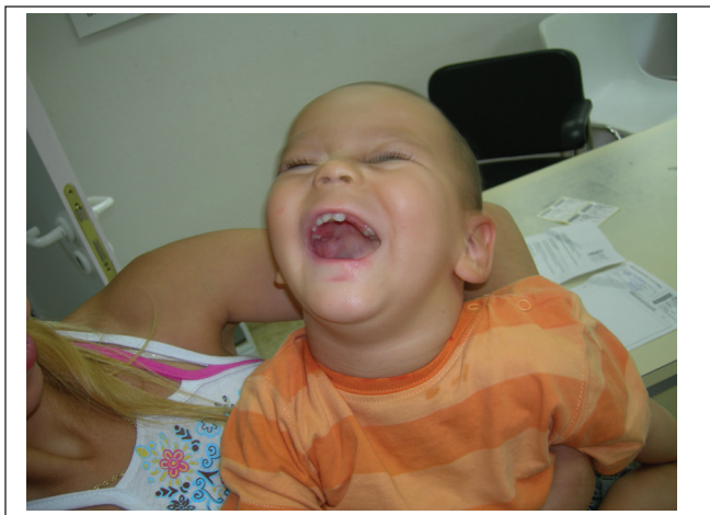
Figure 5. Wounds healed