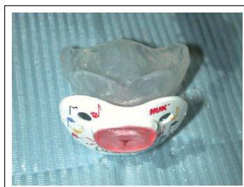
Figure 2. Appliance Design