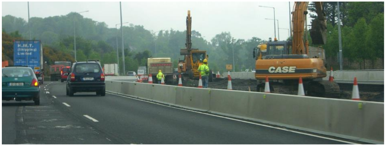
FIGURE 5 Work zone protection at level N2/W4

The market constantly requires higher performance of safety barriers as the demand for more safety, faster installation, smaller design widths and less weight is increasing. This led the industry to develop more specialized products. One barrier type for several containment levels cannot achieve best specific performance. The typical product categories T1, T3 and N2 will bring specific barrier designs in the next view years. T1 will be typically handled by superlight steel barriers. Combining concrete and steel seems to be the right way to best way to achieve highest performance respectively smallest deflection at level T3. In future N2 will be handled by "bigger" versions of T3 barriers. When it comes down to high containment levels starting from H1 up to H4a and H4b best performance can be achieved by heavy barriers made of concrete.