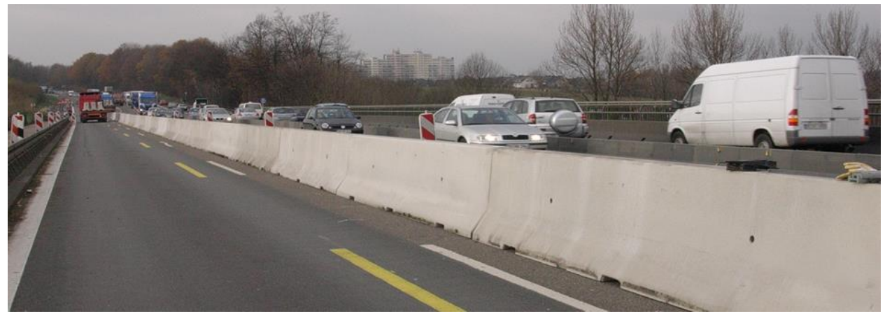
FIGURE 5 Temporary contraflow protection at level H4b/W6