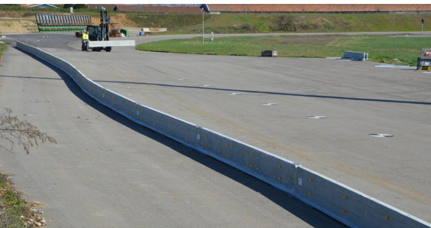
FIGURE 5 Working width W2 after a TB41/T3 impact (36,6kJ impact energy) on a 125kg/m slimtype barrier