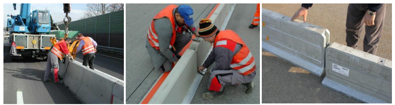
FIGURE 5/6/7 Installing Concrete Barriers – New Jersey type barriers with heavy equipment (l), slim-type barriers with screws (m), tight-fitting superlight barriers without any tools (r)

Any time consuming setup of a construction site results not only in additional costs but also in a weaker traffic flow. Modern work zone safety barriers can be installed very fast. Some types even designed to work without screws or bolts. This does not only save time. The simpler the installation the safer it is for the road workers. New installation concepts even try to realize the installation of barriers without a worker on the ground. However the width of operation of an installation team should be reduced to a minimum. Therefore many barrier types come with their special installation equipment for optimal installation performance.