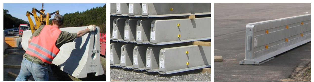
FIGURE 5 Standard New Jersey type barriers at 500kg/m, 60cm width (l), slim type barriers at 180kg/m, 32cm width (m), superlight slim-type barriers at 125kg/m, 24 cm width (r)

Maximizing the room for both the flowing traffic and the work zone is obligatory in modern traffic management. This results in the fact that only barriers with best working width performance are used in high grade infrastructure work zones. As the working width of a safety barrier is defined by its design width and deflection the trend for small barriers seems logical. However the main driver for slim safety barriers is their application as separators for contraflow traffic. Often the opposite traffic lanes are within the barriers working width for that type of application therefore the design width is the crucial aspect.