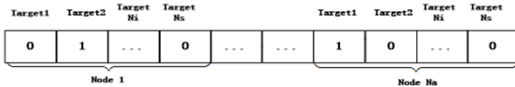
Fig.1 The structure of a particle

Particle encoding. The main idea of this method is converting the matrix X into a vector with N_s \times N_a elements, so that each particle's position vector can represent the nodes selection result. Fig.1 shows the structure of a particle.