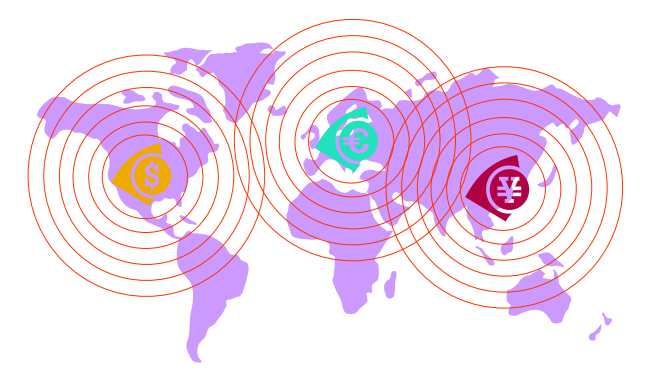
Fig. 1. Type 2b globalization icon visualizing the nature of financial globalization

Today's information technology allows increased transparency of financial markets by real time interconnection of different financial market places. Of the financial market places we will apply here mainly commodity exchanges but also the money markets, but less the more regional stock exchanges. In the following, we will talk only about commodity exchanges where the raw materials of globalization type 1a are traded resulting in a world reference price for commodities. Commodity exchanges have been established in the main market regions of the triad competition, namely Asia, Europe, and America. These financial market places are highly interlinked as the financial globalization type 2b icon of the Globalization Types Model shows (figure 1), i.e. price fixings occurring on the Shanghai Futures Exchange will have effects on the London Metal Exchange and later on the Chicago Mercantile Exchange.